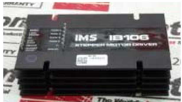
Veritas iB Stepper Motor Control Panel

Due to part obsolescence, the IB106 Stepper Driver (12706P) for the Veritas iB belt handler will no longer be available and will be replaced with update kit # 27533A when needed.